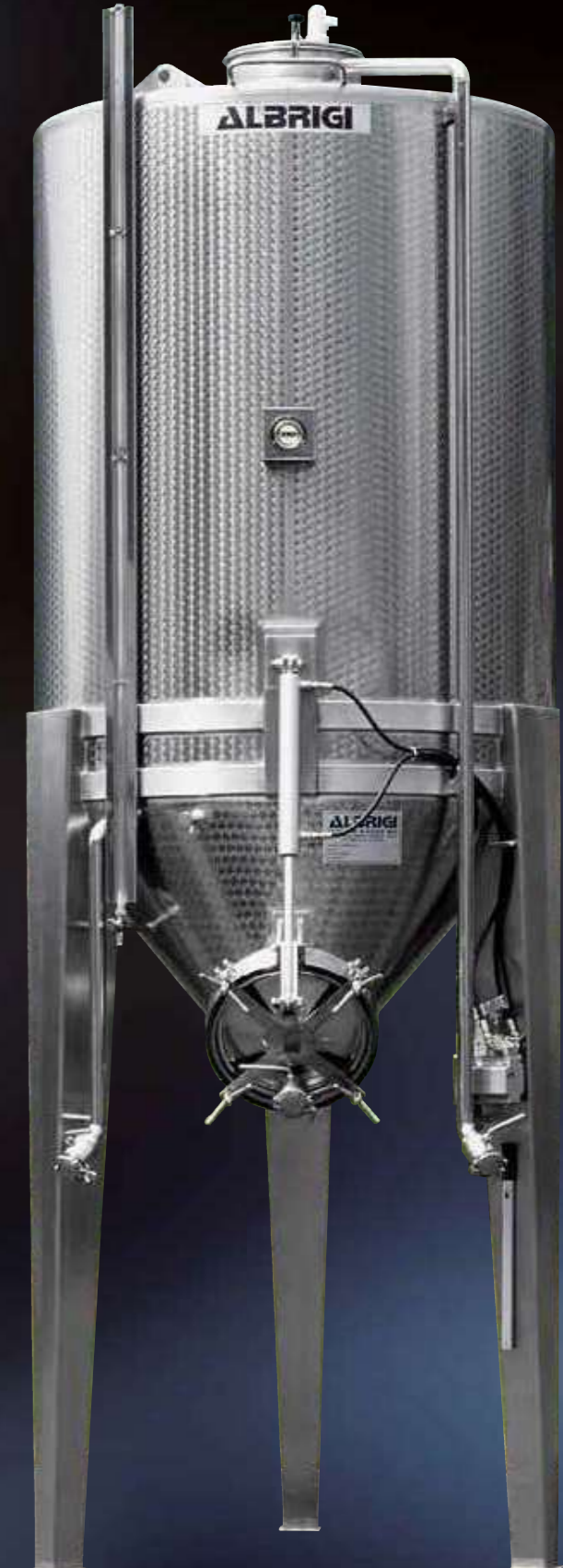
Gravitank, the only fermentation tank that drains marc without using mechanical mechanisms