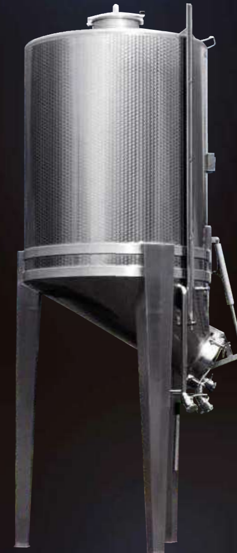
The offset truncated cone bottom favors gravity drainage of the marc