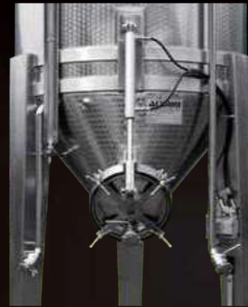
Gravitank with door closed and locked in place