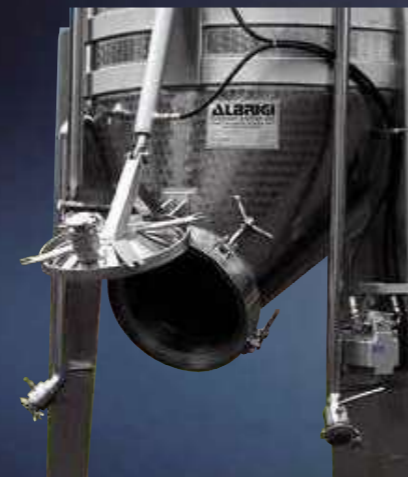
Totally open front door