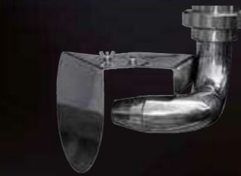
Self-rotating Autofly sprayer to homogeneously spray must on the cap of marc