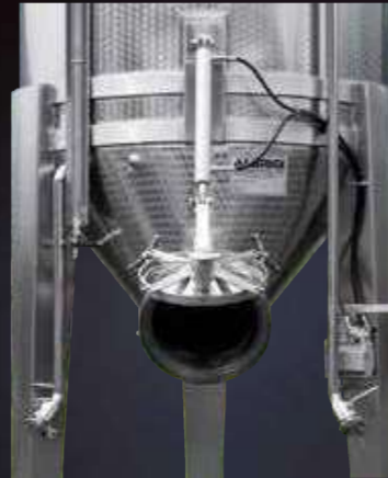
Gravitank with door totally open