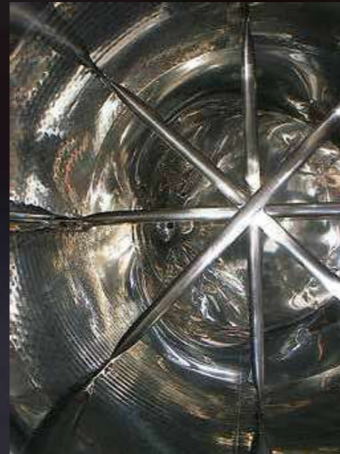
Palitank for délestage and to break up the cap during fermentation and also a help when draining off marc at the end of the fermentation